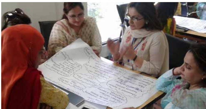
Candidates of Cambridge Diploma in Teaching with Digital Technologies engrossed in discussion

The three Cambridge Diploma Qualifications titled Diploma in Educational Leadership, Diploma in Teaching & Learning & Diploma in Teaching with Digital Technologies have been successfully concluded in June 2017. The duration of each PDQ was 18 months; altogether about 48 school leaders & teachers have successfully completed the courses. These professional development qualifications have not only brought a remarkable improvement in teaching & leadership practices but have helped enhancing collaboration through online & F2F professional learning communities as well. We take pride in sharing that the Cambridge has published the case study of one of our participants of Diploma in Teaching with Digital Technologies in Cambridge Global Community of Programme Leaders. Here is a link to access the case-study: https://cambridge-community.org.uk/professional-development/candidate-case-study/